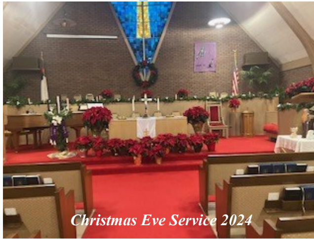
Christmas Eve Service 2024